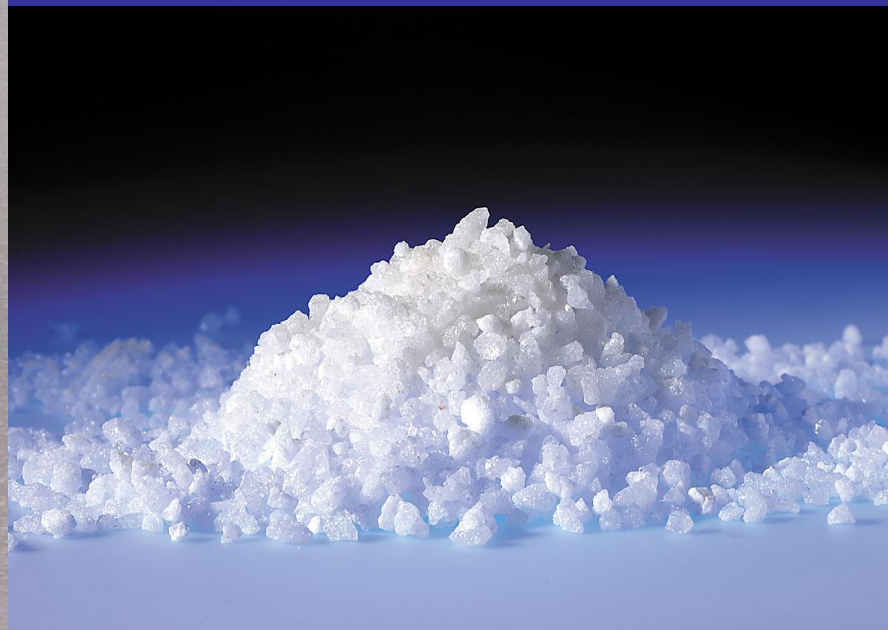
White fused alumina