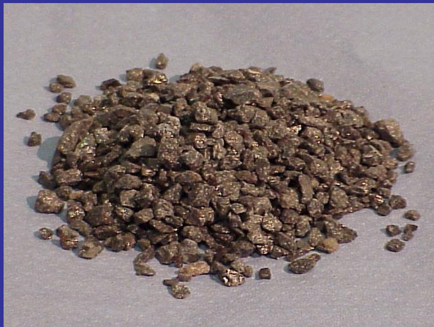
Brown fused alumina