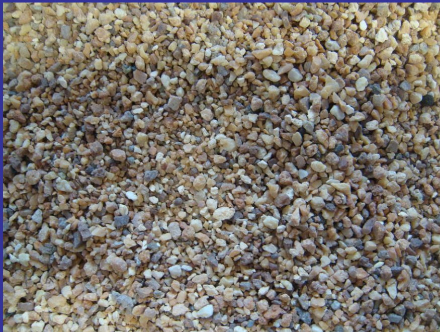
Calcined Chinese magnesite