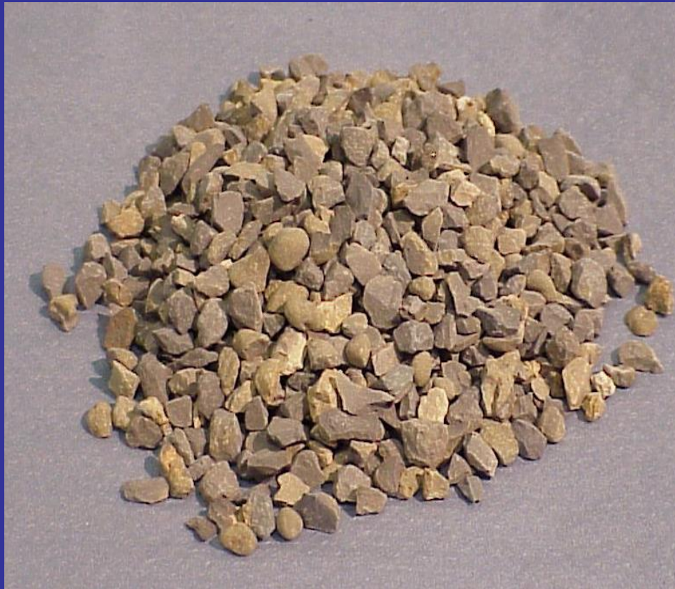
Calcined Chinese bauxite